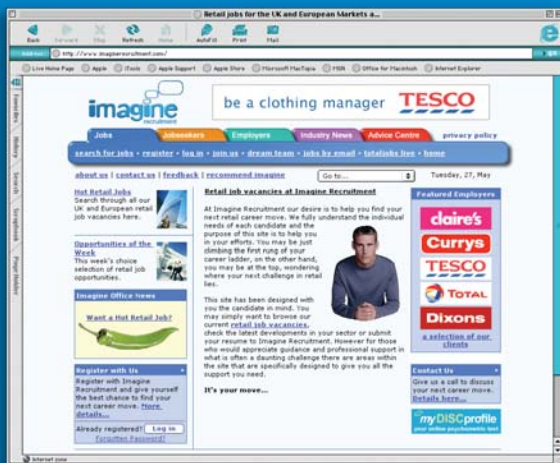
Screen capture of our website: www.imaginerecruitment.com